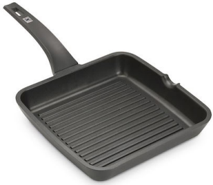
Induction PRO - Grill pan 8212 000